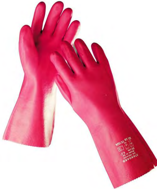
SR 9-35 SR 10-35 SR 11-35