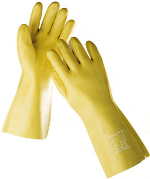
SY 9-35 SY 10-35